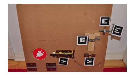
(b) The bigger version of the mechanism to fit the needs of a PR2 robot.